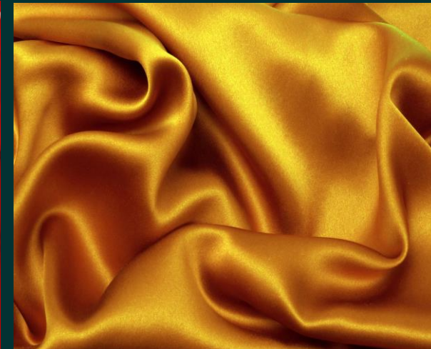
Texture of choice