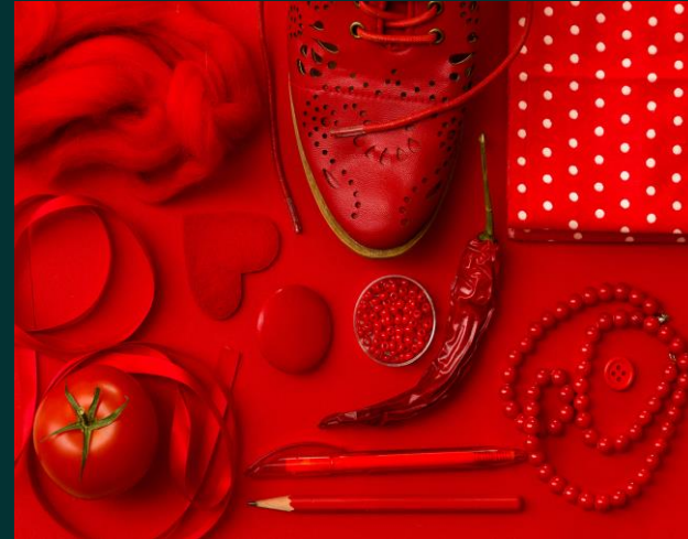
Color of choice