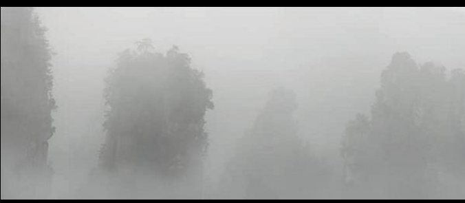
Dark blacks and bright whites. Used to create calm, quite, soft, quiet